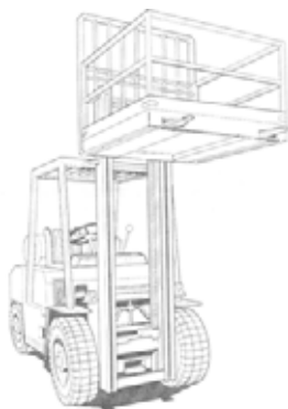
Figure 1 – Counterbalance truck with non-integrated working platform

4. Examples of forklift trucks fitted with platforms are given below:-